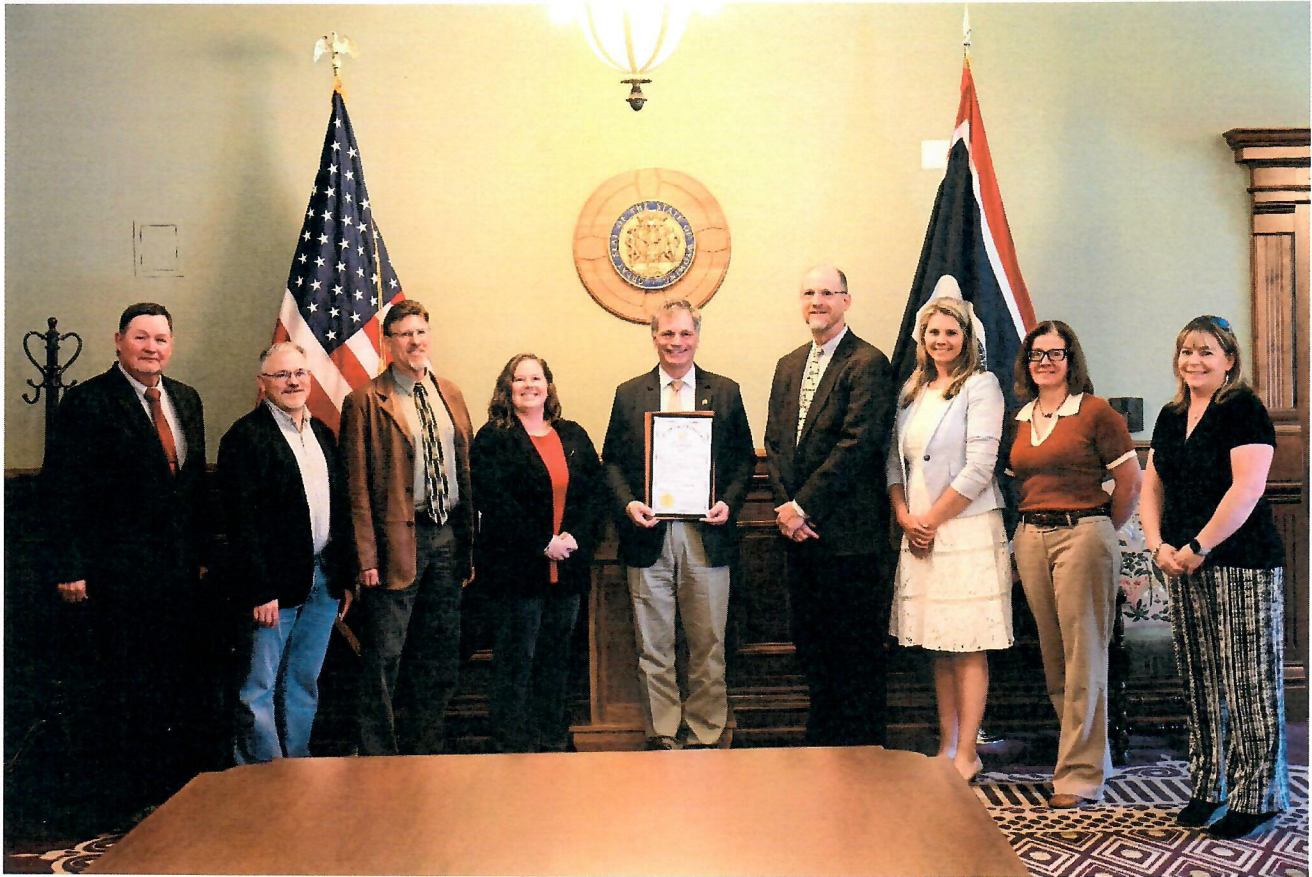
Governor Gordon holds the signed Proclamation with those from the Department of Environmental Quality and the WSWRA Board

“Whereas it is fitting to recognize and honor the efforts of solid waste and recycling workers in providing a critical service to the people of Wyoming while protecting human health and our environment...” These were words read by Wyoming Governor Mark Gordon as he signed a Proclamation recognizing Wyoming’s Solid Waste and Recycling Workers. This was part of a weeklong effort by the Wyoming’s Department of Environmental Quality (WDEQ) Solid Waste Permitting and Corrective Action Program to recognize those in the solid waste industry.